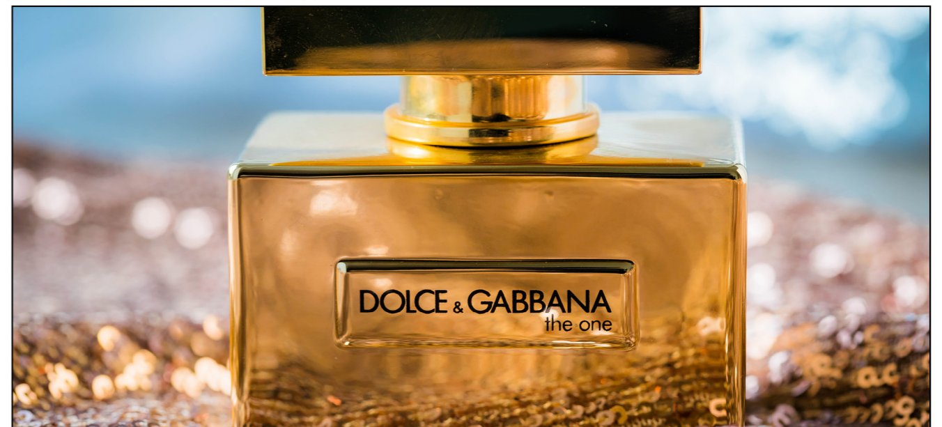
Jewelry provided by Treger Group